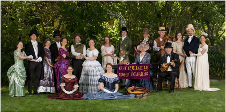
Image: EDHDA Dancers & Musicians.